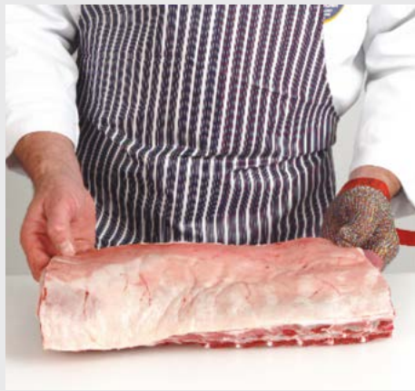
5. Loin without chump – external view.